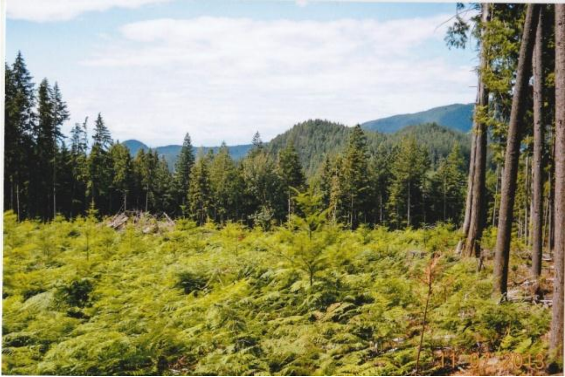
Picture: Gambier Island small scale forestry